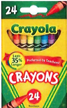
2 packs of 24 Crayola Crayons