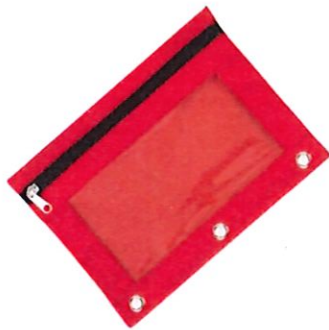
1 Pencil Pouch with zipper