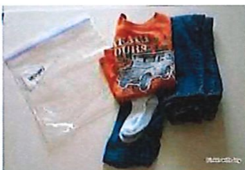
Change of clothes (put in Ziploc bag)

The following items are WISH LIST Items.