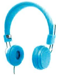
1 pair of headphones (No Earbuds)