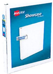
1 inch 3 ring white binder with clear cover pocket