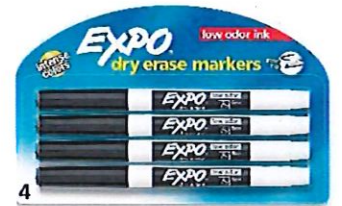
1 pack of Black Fine Expo Markers

The following items are WISH LIST Items.