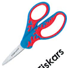
1 pair of Fiskars scissors