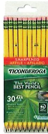
1 pack of Ticonderoga Pencils